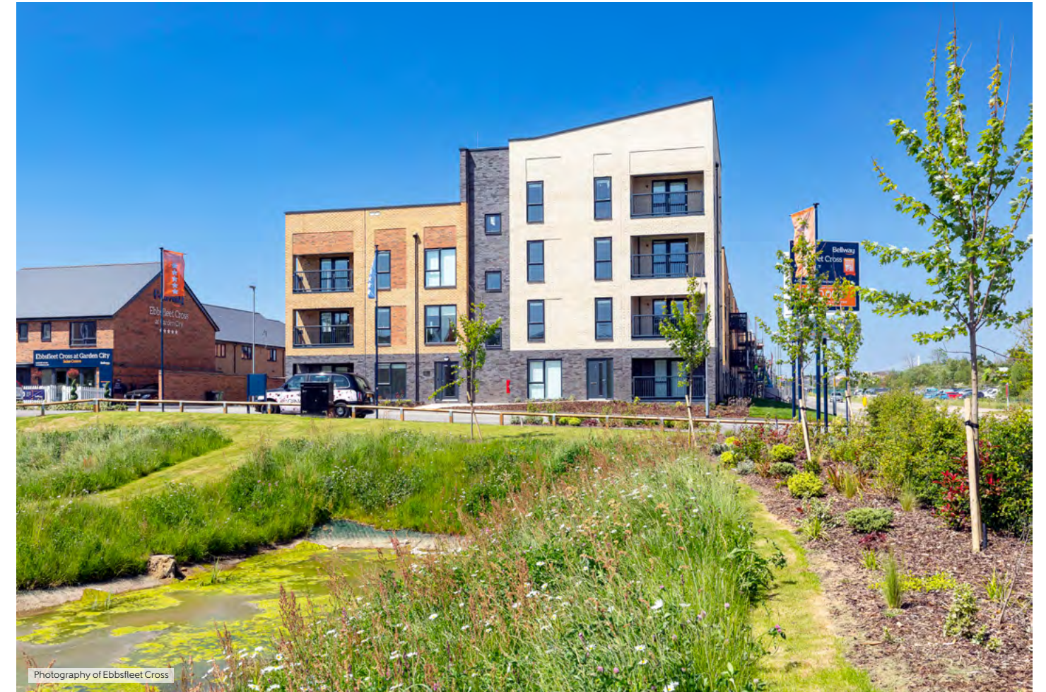
Photography of Ebbsfleet Cross